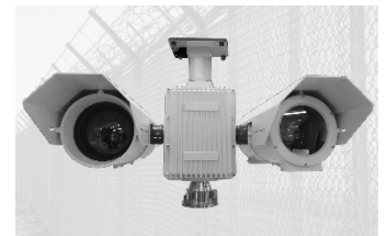
THROUGH SHAFT Enables fixed payloads to be mounted above the PT Director