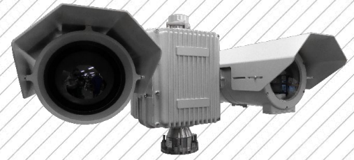
Above: Jaegar Ranger EVO2 25-225mm. Other models will vary.