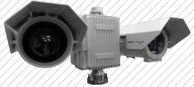
Above: Jaegar Ranger EVO2 25-225mm. Other models will vary.

The Jaegar EVO2 is a high performance, multi sensor platform which utilises long range uncooled LWIR thermal sensors with a range of zoom lens options up to 20-300mm, alongside the latest low light HD visible sensors with zoom lens options up to 20-2400mm. The EVO2 range employs the latest 12µm thermal technology which has push autofocus capabilities as standard.